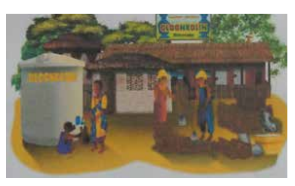
Preparation training Kenya