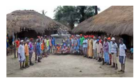
Catunco meeting about payment in rice

Website: the Manual of the Calabash tank and the annual figures of 2017 can be found on the site: www.degevuldewaterkruik.nl