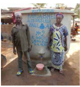
Spreading of Calabash tank