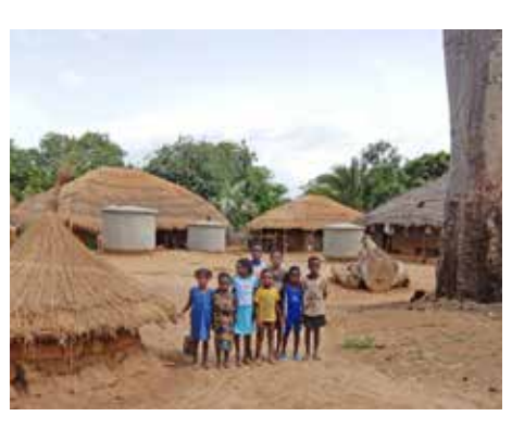
10.000 l. tank at school